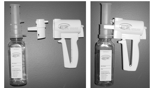
To release vacuum, see #7